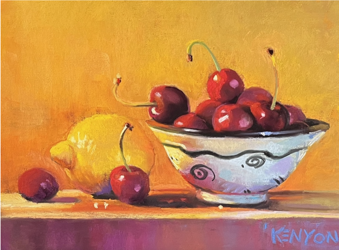
Best Of Show: "Sweet and Sour," by Liz Kenyon